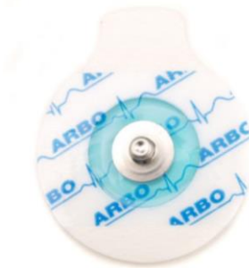
Fig. 2: Electrodes with Arbo branding.