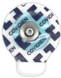
Fig. 1: Electrodes with Covidien branding.

All self-adhesive & disposable electrodes are based on the Covidien Arbo™ H124SG Electrodes . Based on supplier availability, these electrodes may also be provided with different branding names such as: Kendal™ ECG Electrodes or Cardinal Health . Images of the electrodes with different brandings are displayed below.