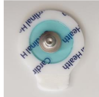
Fig. 3: Electrodes with Cardinal Health branding.

For further details on the H125SG Electrodes, please refer to the original datasheet: